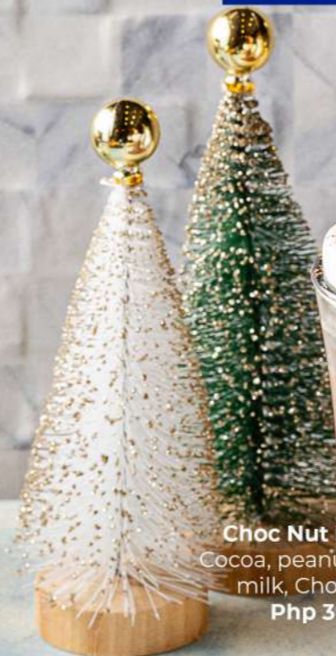
Choc Nut Batirol Cocoa, peanut butter, milk, Choc Nut Php 399