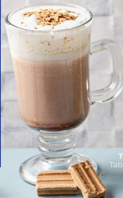
Tsokolate Batirol Tablea chocolate, milk, marshmallows Php 399

Festive Bibingka and Puto Bumbong with Batirol of your choice Php 988 | good for two (2) persons