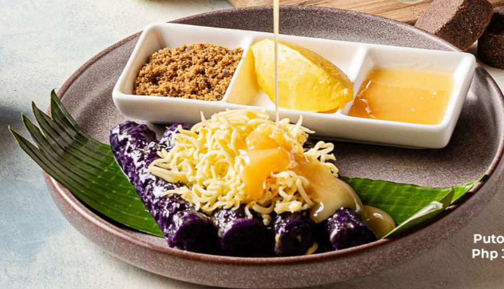
Puto Bumbong Php 399 / 4 pcs.

Prices are inclusive of service charge and applicable government taxes.