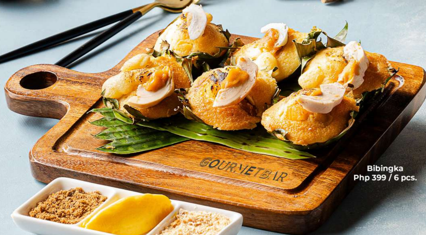
Bibingka Php 399 / 6 pcs.